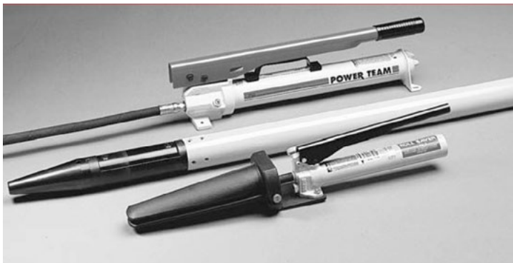
Mark I and Mark II Roll Savers